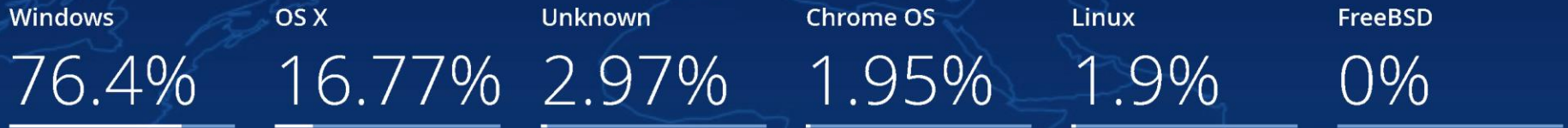
Desktop Operating System Market Share Worldwide - January 2021